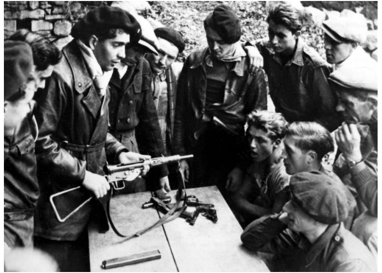
War history online, WW2