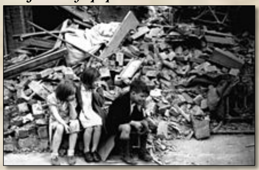
Innocent children in front of ruins, 1940.

Of course, when you heard planes above you it was not reassuring. I was even afraid to sleep at night. My sister did some nightmares. I had to reassure her.